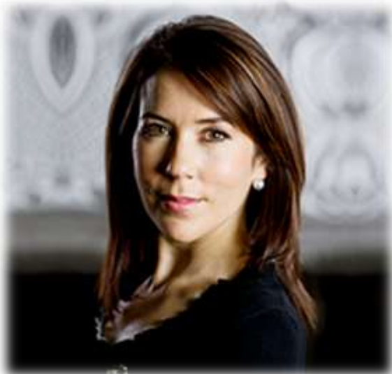
H.R.H. Crown Princess Mary

“The objective of The Mary Foundation is to prevent social isolation and help those who are socially isolated, to encourage tolerance and understanding of diversity, and to create hope”.